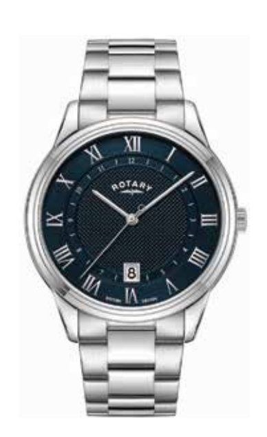
GB05390/66 Ø 40mm

Quartz Movement Sapphire Crystal Water Resistant 50m