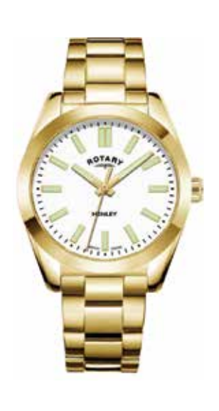
LB05283/29 Ø 30 mm