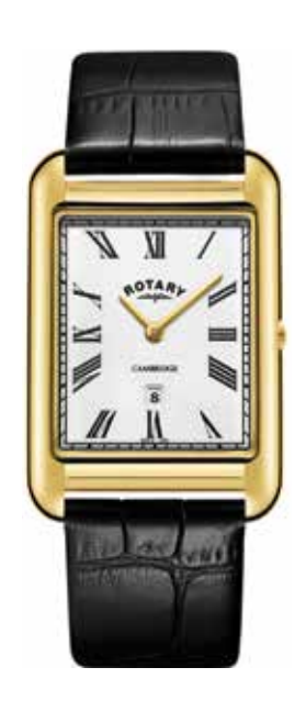
GS05283/01 Ø 28.5 x 42mm