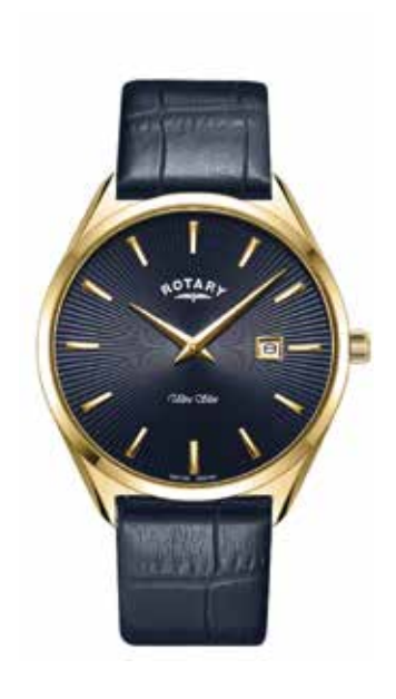
GS08013/05 Ø 38mm