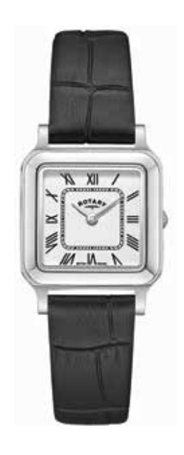
LS05540/01 Ø 23mm x 23mm