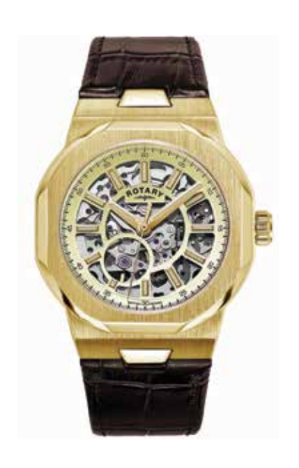
GS05418/03 Ø 40mm