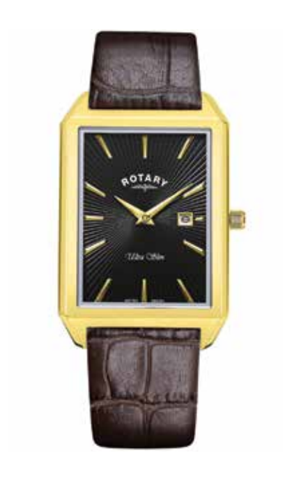
GS08023/04 Ø 44mm x 28.5mm

Quartz Movement Sapphire Crystal Water resistant 50m