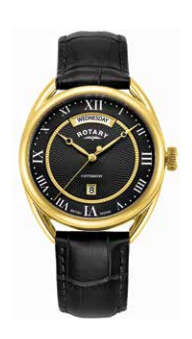
GS05533/10 Ø 38mm