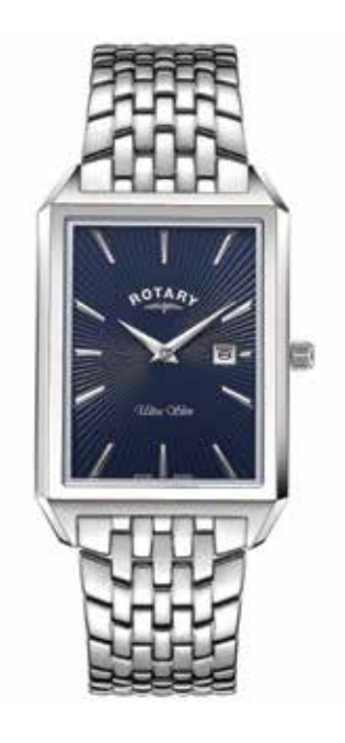
GB08020/05 Ø 44mm x 28.5mm