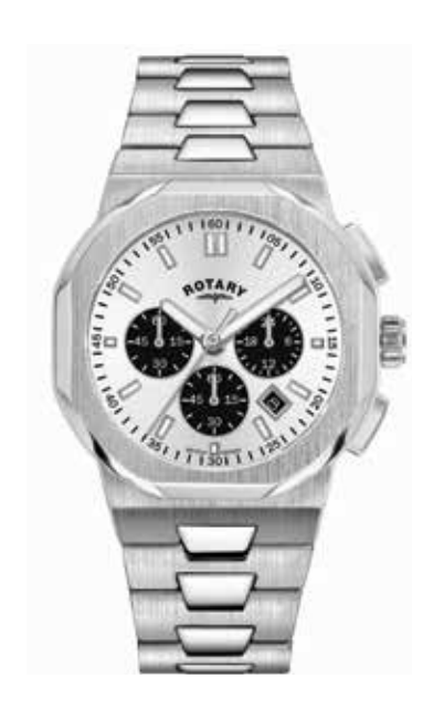
GB05450/59 Ø 40mm