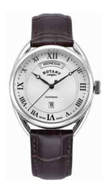
GS05530/21 Ø 38mm