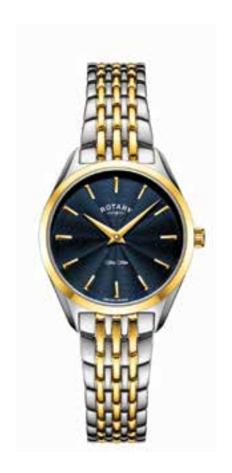
LB08011/05 Ø 27mm