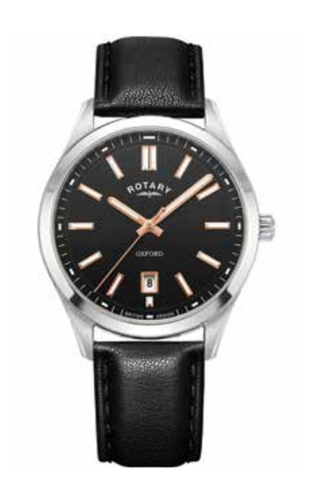
GS05520/04 Ø 40mm