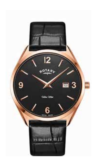
GS08014/04 Ø 38mm