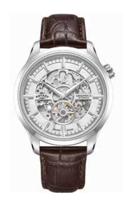
GS02945/06 Ø 42mm