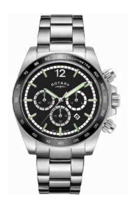
GB05440/04 Ø 41mm