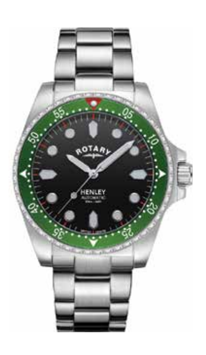
GB05136/71 Ø 41mm