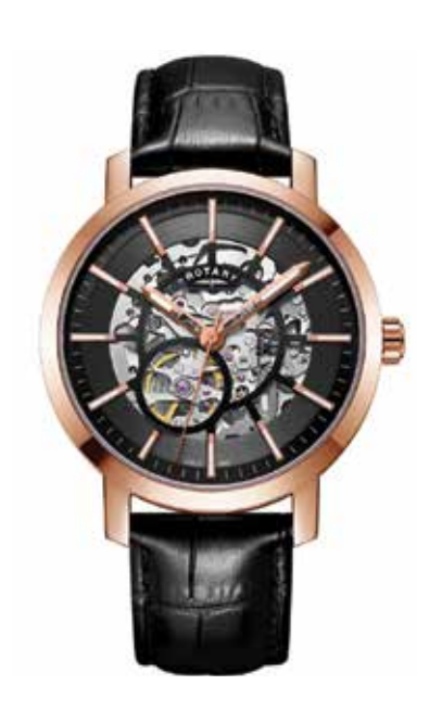
GS05354/04 Ø 42mm