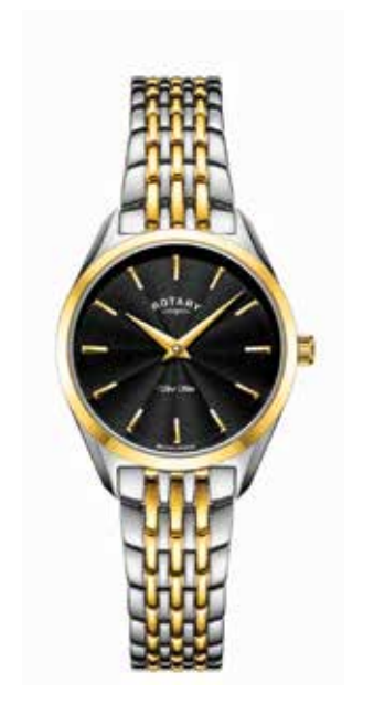
LB08011/04 Ø 27mm

Quartz Movement Sapphire Crystal Water resistant 50m Case Profile 5.7mm