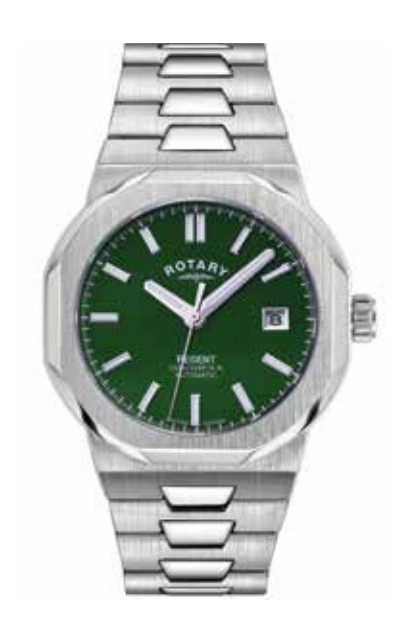
GB05410/24 Ø 40mm