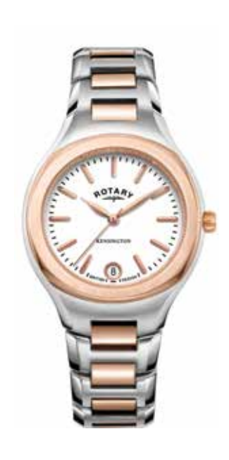
LB05106/02 Ø 32mm