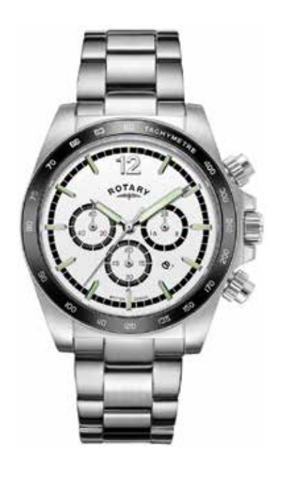
GB05440/02 Ø 41mm

Quartz Movement Chronograph Sapphire Crystal Water resistant 100m Luminous Hands & Indices