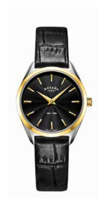
LS08011/04 Ø 27mm