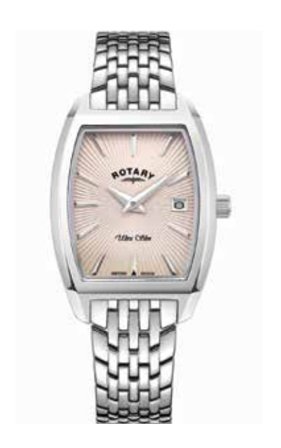
LB08015/90 Ø 35mm x 25mm