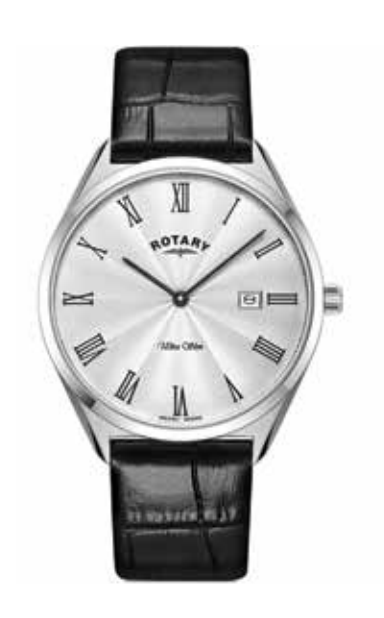
GS08010/01 Ø 38mm