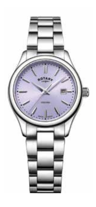
LB05092/75 Ø 32mm