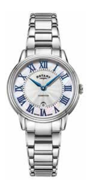
LB05425/07 Ø 30mm

Quartz Movement Sapphire Crystal Water Resistant 50m Mother Of Pearl Outer Dial Guilloche Patterned Inner Dial