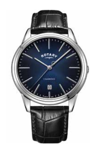
GS05390/05 Ø 40.5mm

Quartz Movement Sapphire Crystal Water Resistant 50m Sleek Hidden Crown