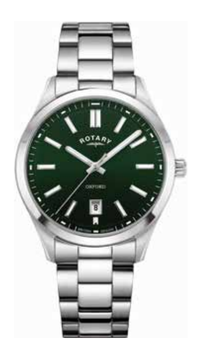
GB05520/24 Ø 40mm