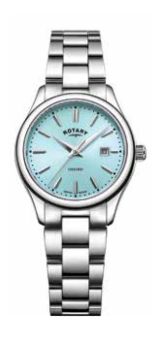
LB05092/77 Ø 32mm

Quartz Movement Sapphire Crystal Water resistant 50m