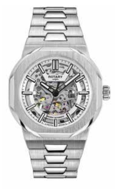
GB05495/06 Ø 40mm

Automatic Movement Skeleton Dial Sapphire Crystal Water Resistant 100m Super Luminova Indices