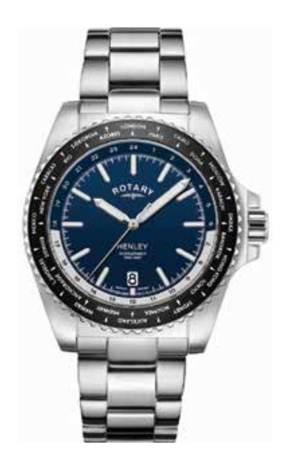
GB05370/88 Ø 41mm