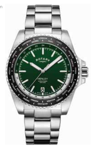
GB05370/78 Ø 41mm

Quartz Movement World Timer Sapphire Crystal Water Resistant 100m