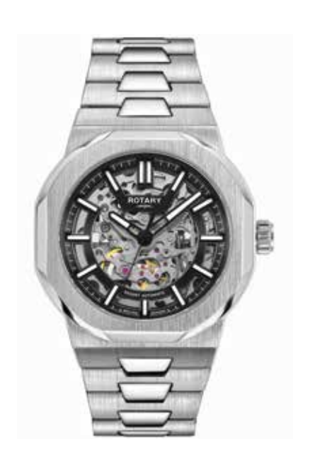
GB05495/04 Ø 40mm

The epitome of powerful design, Regent includes various features & designs including the Skeleton, Analogue and Chronograph sport, with the trademark look of the multi-facetted brushed stainless steel case and mounted on an integrated tapered h-link bracelet.