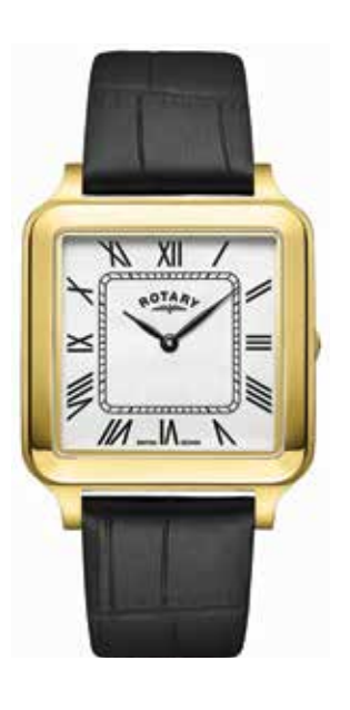
GS05543/01 Ø 34mm x 34mm