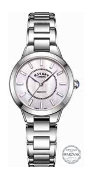
LB05375/07 Ø 29mm

Quartz Movement Sapphire Crystal Water resistant 50m Mother Of Pearl Dial Swarovski Crystals