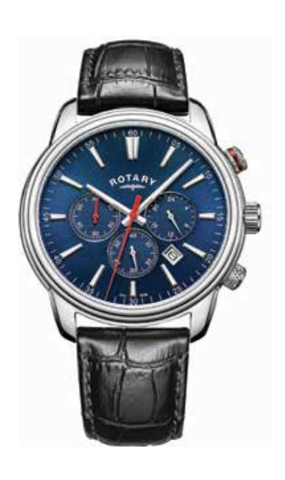
GS05083/05BLK Ø 42mm