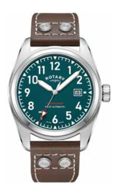
GS05470/73 Ø 42mm