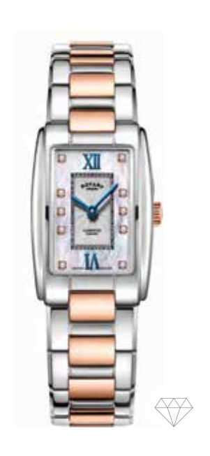
LB05437/07/D Ø 21.5 x 33mm Diamond