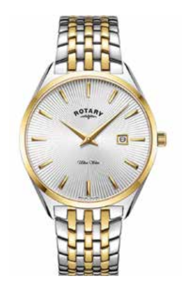
GB08011/02 Ø 38mm

Quartz Movement Sapphire Crystal Water resistant 50m Case Profile 5.7mm