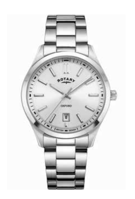
GB05520/06 Ø 40mm

Quartz Movement Sapphire Crystal Water resistant 50m