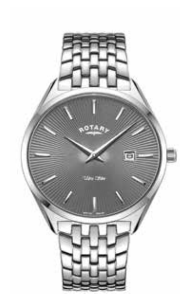
GB08010/74 Ø 38mm

Ultra Slim round 38mm case exudes sleek sophistication with a profile of just 5.7mm, making this watch range unparalleled in comfort and the perfect timepiece to slip under a shirt cuff. Each refined timepiece is designed to complement and is enhanced with slimline innovation.