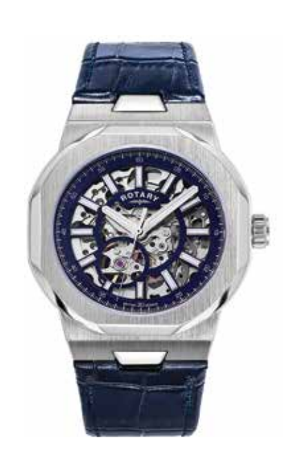
GS05415/05 Ø 40mm