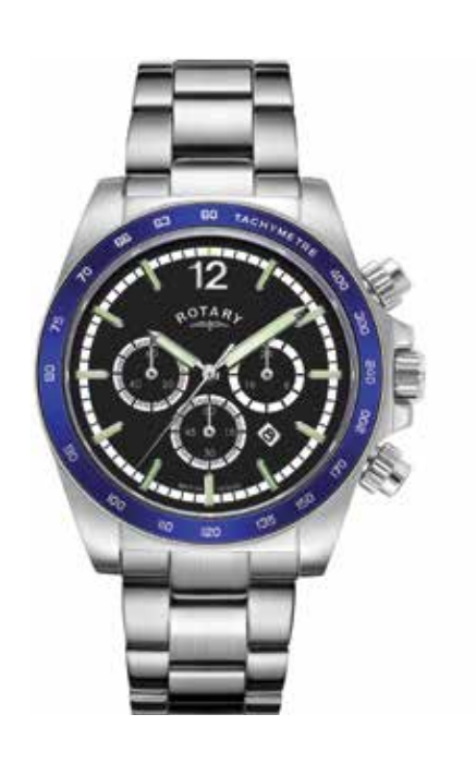
GB05440/72 Ø 41mm