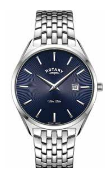
GB08010/05 Ø 38mm