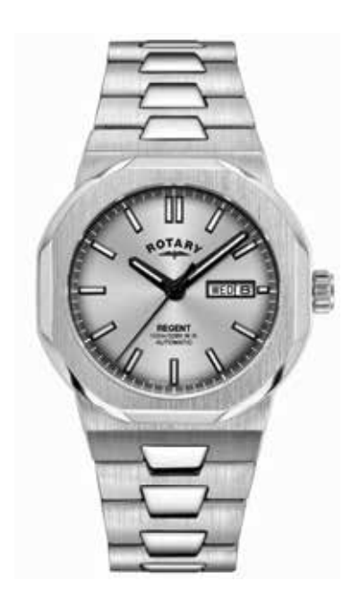
GB05490/06 Ø 40mm