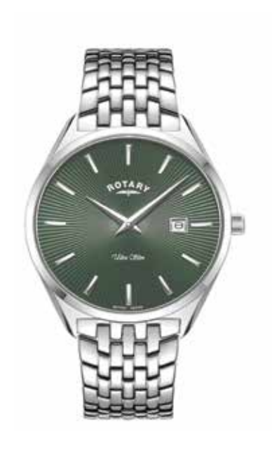
GB08010/24 Ø 38mm