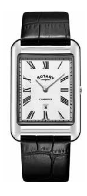
GS05280/01 Ø 28.5 x 42mm

Quartz Movement Curved Sapphire Crystal Water Resistant 50m Retro Infused Sleek Hidden Crown