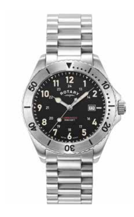
GB05475/19 Ø 40mm

Quartz Movement Sapphire Crystal Water Resistant 100m