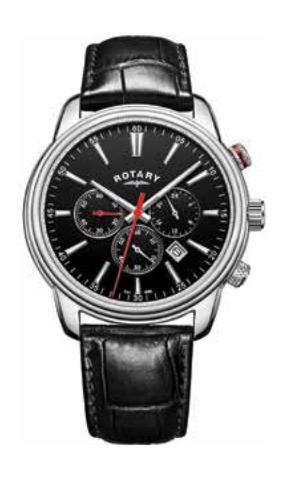
GS05083/04 Ø 42mm

Quartz Movement Chronograph Sapphire Crystal Water resistant 50m