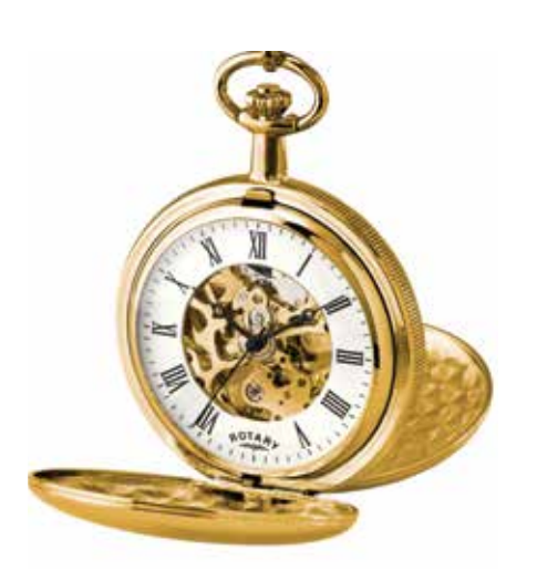
MP00727/01 Ø 45mm

Rotary pocket watches give the wearer opportunity for a vintage look with modern technology. The Classic pocket watches come with a mechanical movement including a chain.