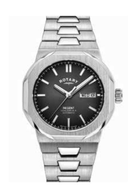
GB05490/04 Ø 40mm