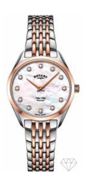
LB08012/41/D Ø 27mm Diamond