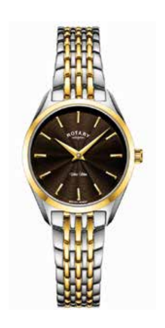
LB08011/49 Ø 27mm