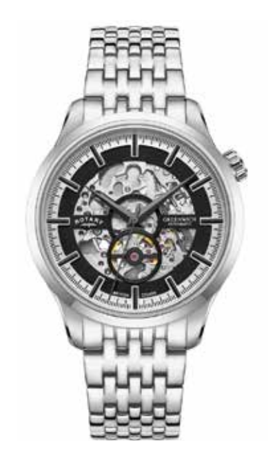
GB02945/87 Ø 42mm

Automatic Movement Skeleton Dial Sapphire Crystal Water Resistant 50m Super Luminova Indices Tube Crown