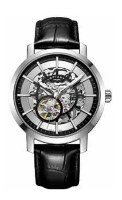
GS05350/02 Ø 42mm

Automatic Movement Skeleton Dial Sapphire Crystal Water Resistant 50m Super Luminova Indices