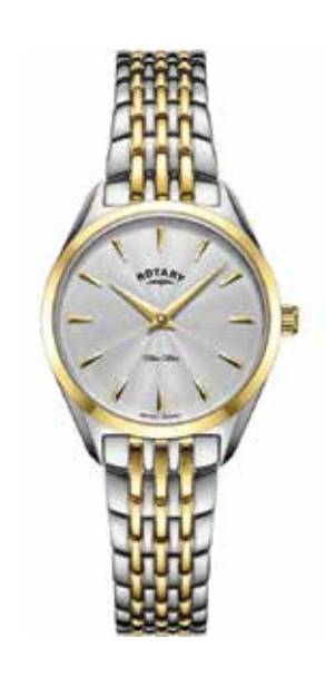
LB08011/02 Ø 27mm