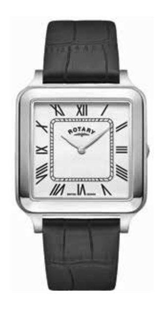
GS05540/01 Ø 34mm x 34mm

Quartz Movement Curved Sapphire Crystal Water Resistant 50m Retro Infused Sleek Hidden Crown