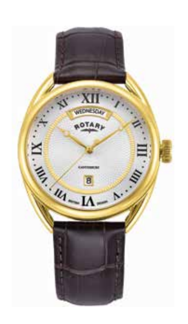
GS05533/21 Ø 38mm