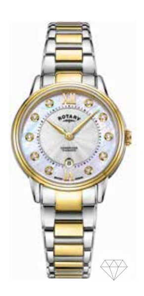
LB05426/07/D Ø 30mm Diamond