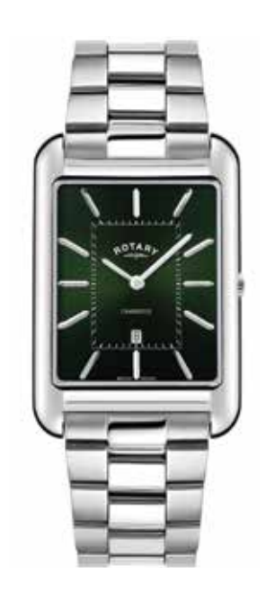
GB05280/24 Ø 28.5 x 42mm