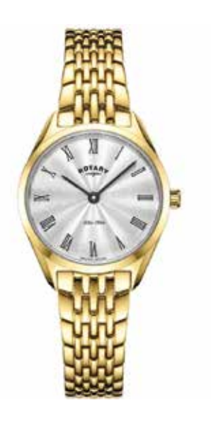
LB08013/01 Ø 27mm