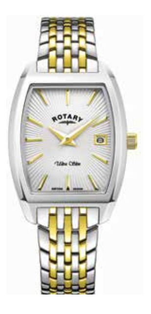
LB08016/06 Ø 35mm x 25mm