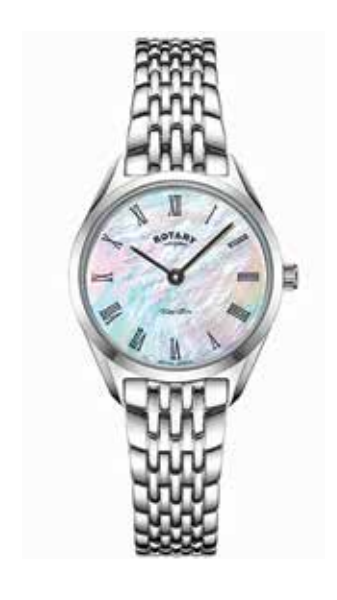
LB08010/41 Ø 27mm

Quartz Movement Sapphire Crystal Water resistant 50m Case Profile 5.7mm