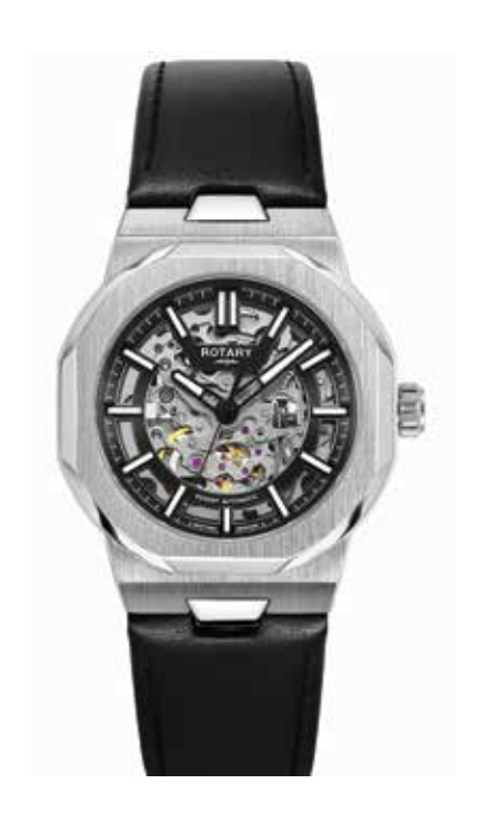
GS05495/04 Ø 40mm

Automatic Movement Skeleton Dial Sapphire Crystal Water Resistant 100m Super Luminova Indices