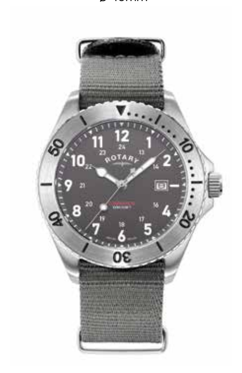
GS05475/48 Ø 40mm