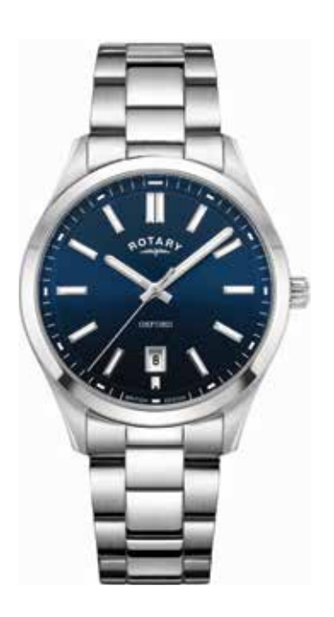
GB05520/05 Ø 40mm

Contemporary Oxford delivers a modern and versatile approach to a dress watch. With a 30mm case, mother of pearl with diamonds or deep blue dial delivers timeless class 50m water resistance and a date at 6 add practicality to this premium design.