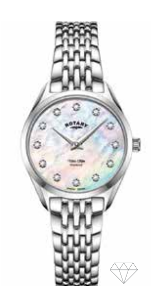
LB08010/07/D Ø 27mm Diamond