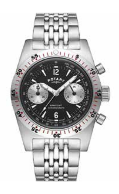
GB05500/30 Ø 38mm

Meca-Quartz Movement Chronograph Bubble Mineral Water Resistant 100m