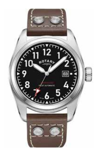
GS05470/19 Ø 42mm

Automatic Movement Sapphire Crystal Water Resistant 100m