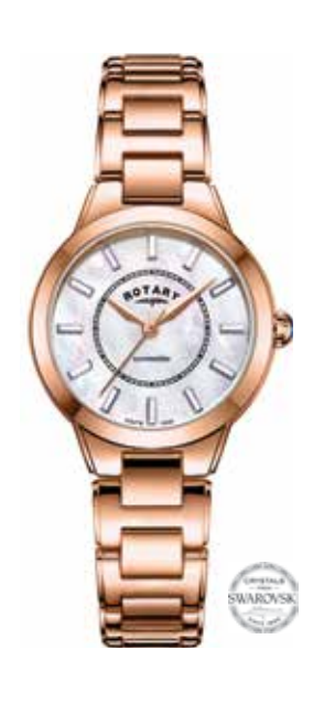
LB05379/41 Ø 29 mm