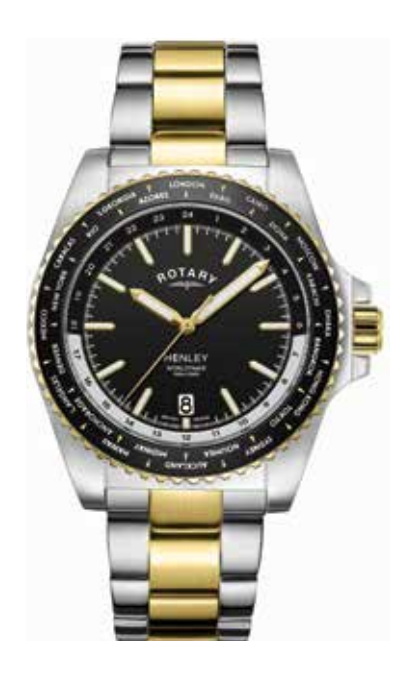
GB05371/04 Ø 41mm