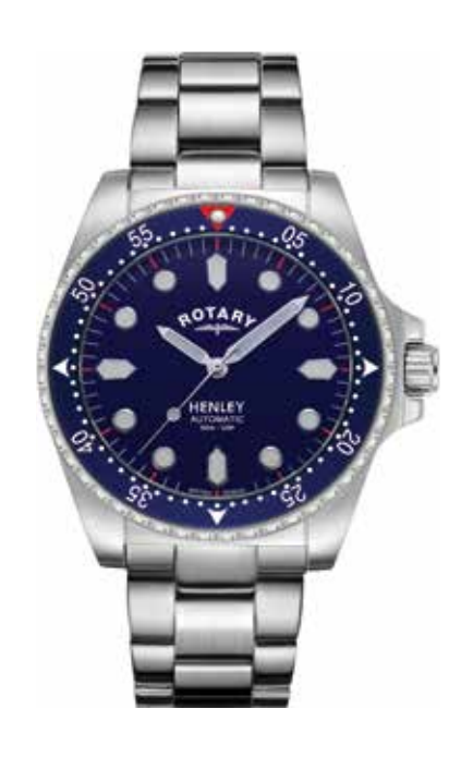
GB05136/05 Ø 41mm