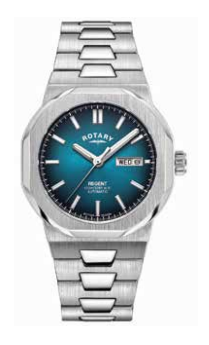
GB05490/73 Ø 40mm

Automatic Movement Sapphire Crystal Water Resistant 100m Super Luminova Indices