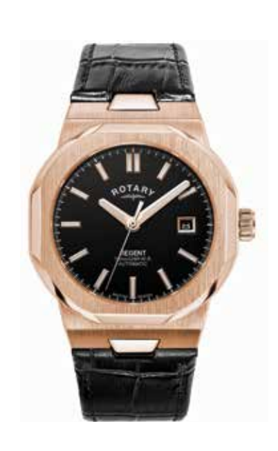
GS05414/04 Ø 40mm