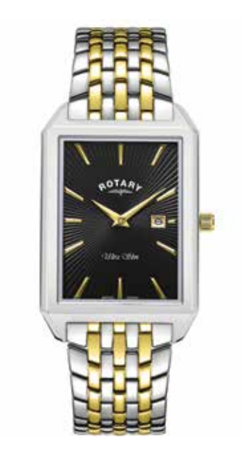
GB08021/04 Ø 44mm x 28.5mm

Quartz Movement Sapphire Crystal Water resistant 50m