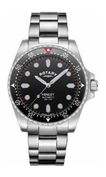
GB05136/04 Ø 41mm

Automatic Movement Sapphire Crystal Water Resistant 100m 316L Stainless Steel with Aluminium Bezel Screw Down Crown Luminous Hands & Indices