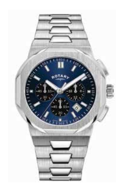
GB05450/05 Ø 40mm

Automatic Movement Chronograph Sapphire Crystal Water Resistant 100m Super Luminova Indices