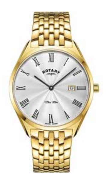
GB08013/01 Ø 38mm