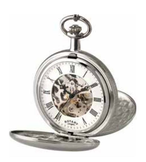
MP00726/01 Ø 45mm