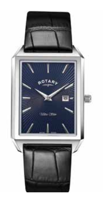
GS08020/05 Ø 44mm x 28.5mm