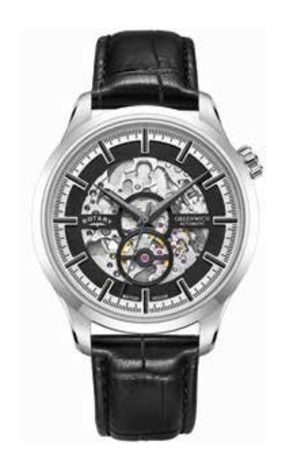
GS02945/87 Ø 42mm