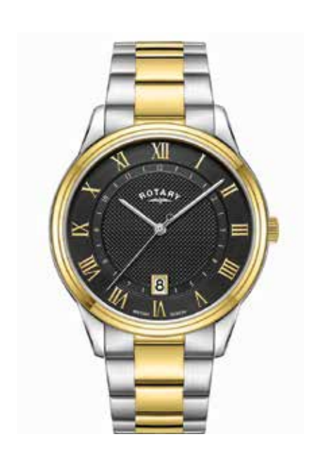
GB05391/10 Ø 40mm