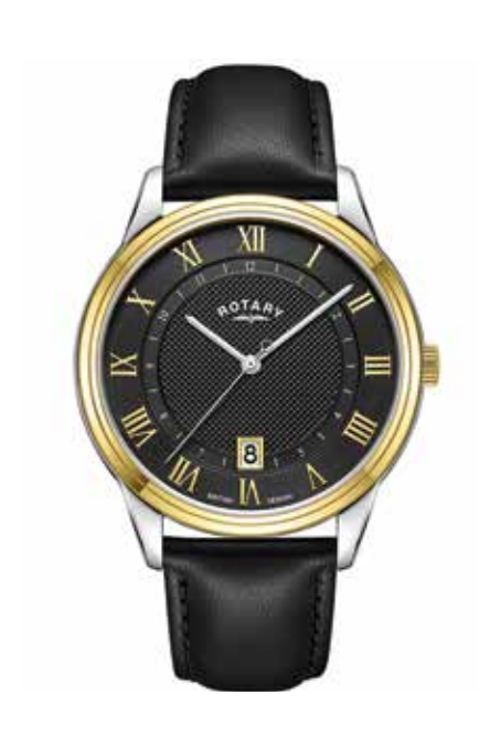
GS05391/10 Ø 40mm