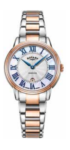
LB05427/07 Ø 30mm