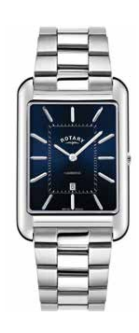
GB05280/05 Ø 28.5 x 42mm