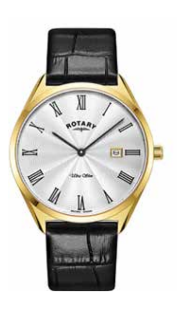
GS08013/01 Ø 38mm