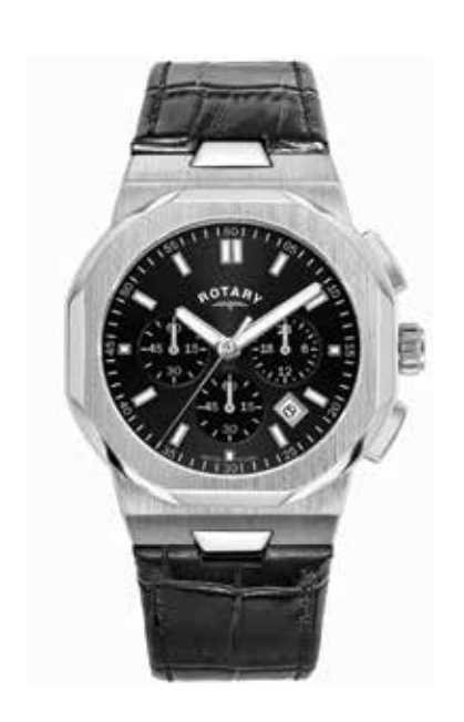
GS05450/65 Ø 40mm