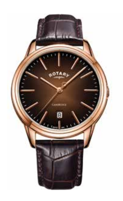
GS05394/16 Ø 40.5mm