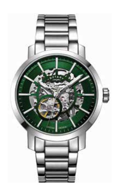
GB05350/24 Ø 42mm

Automatic Movement Skeleton Dial Sapphire Crystal Water Resistant 50m Super Luminova Indices