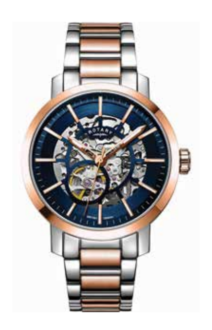
GB05352/05 Ø 42mm