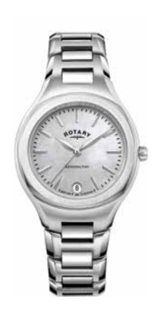
LB05105/41 Ø 32mm

Quartz Movement Sapphire Crystal Water resistant 50m