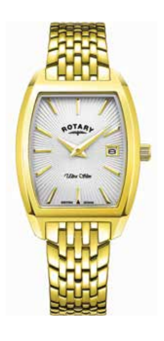
LB08018/06 Ø 35mm x 25mm

Ultra Slim Tonneau, a harmonious blend of lightweight luxury and innovative design. Encased within the profile of 6.5mm and size of 35mm x 25mm case. This watch delivers a refined statement that effortlessly marries tradition with slimline innovation.