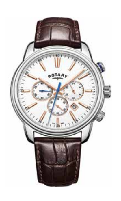
GS05083/06 Ø 42mm