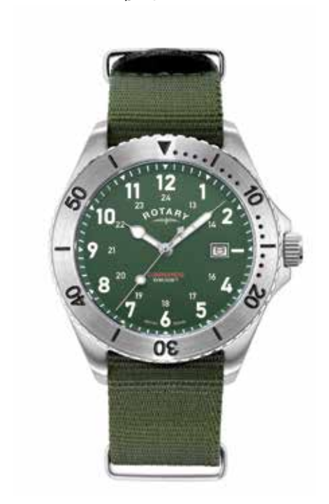
GS05475/56 Ø 40mm