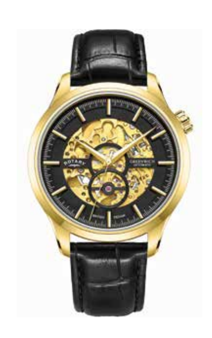
GS02948/04 Ø 42mm