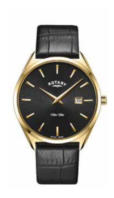
GS08013/04 Ø 38mm

Quartz Movement Sapphire Crystal Water resistant 50m Case Profile 5.7mm