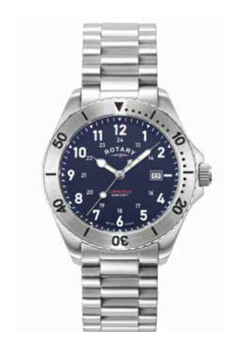
GB05475/52 Ø 40mm