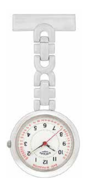
LP00616 Ø 32mm

The Rotary Fob nurses watch is developed for specific needs. Practical with a clear white dial, black arabic numerals and red pulse markings.