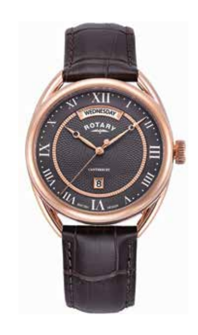
GS05534/74 Ø 38mm