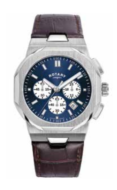
GS05450/05 Ø 40mm