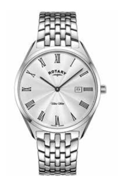
GB08010/01 Ø 38mm

Quartz Movement Sapphire Crystal Water resistant 50m Case Profile 5.7mm