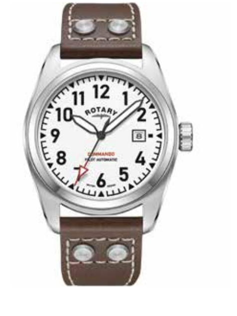
GS05470/18 Ø 42mm