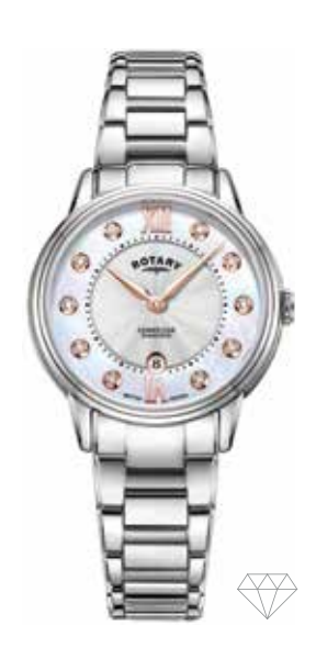
LB05425/07/D Ø 30mm Diamond