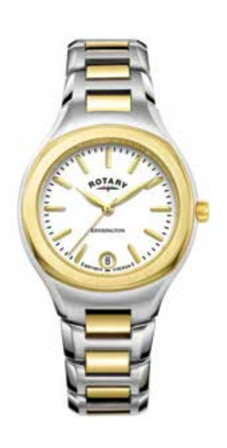
LB05107/02 Ø 32 mm