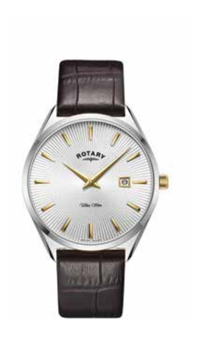
GS08010/02 Ø 38mm