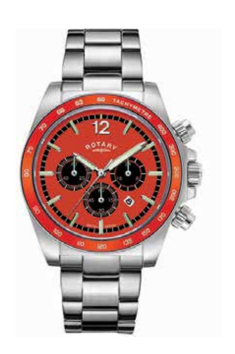
GB05440/54 Ø 41mm