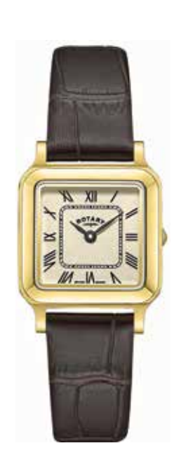
LS05543/09 Ø 23mm x 23mm