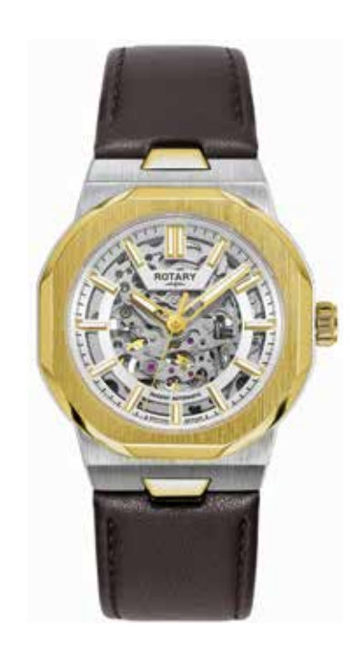
GS05496/06 Ø 40mm