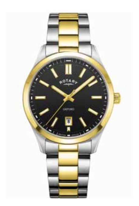
GB05521/04 Ø 40mm