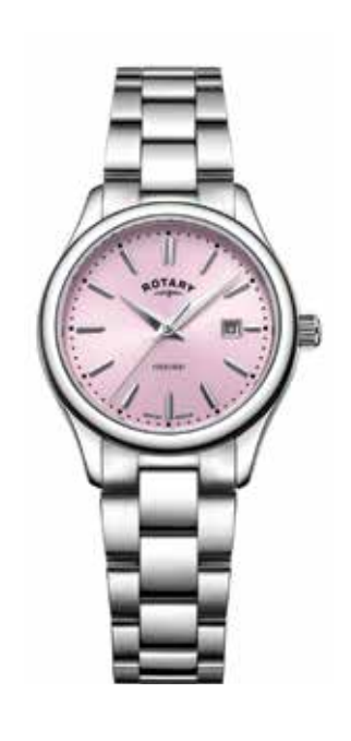
LB05092/76 Ø 32mm