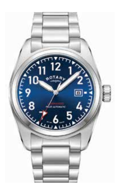
GB05470/52 Ø 42mm

Inspired from the design archives of Rotary's 20th century history. Cammando RW 1895 is a military-inspired timepiece, with focus on functionality, legibility and robustness; while maintaining a wearable aesthetic for everyday use.