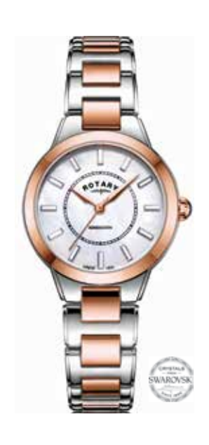
LB05377/41 Ø 29 mm