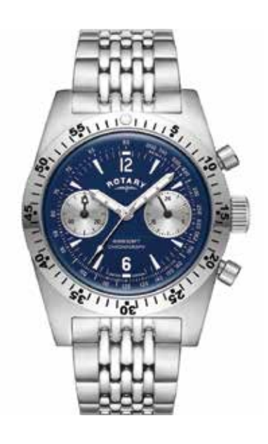
GB05500/05 Ø 38mm