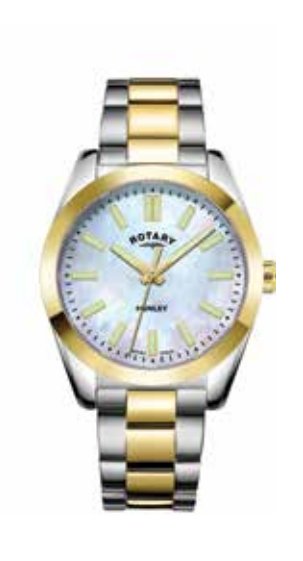
LB05281/41 Ø 30 mm