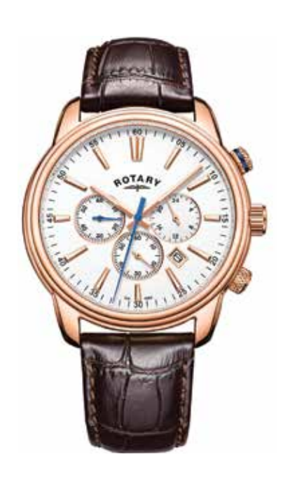
GS05084/06 Ø 42mm