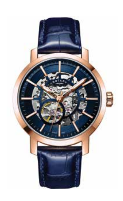
GS05354/05 Ø 42mm