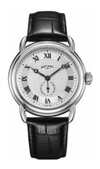
GS02424/21 Ø 38mm

Quartz Movement Sapphire Crystal Water Resistant: 50m