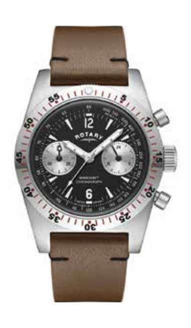
GS05500/30 Ø 38mm