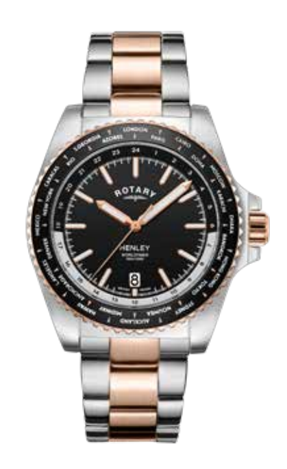
GB05372/04 Ø 41mm

For frequent globetrotters, transferring through time zones in quick succession, the Rotary WorldTimer is the watch for you. The WorldTimer accomplishes a similar task to the GMT or dual time zone; it shows the wearer a time zone in one or two time zones other than home. The difference with the WorldTimer is that it shows the time for 24 time zones at once!